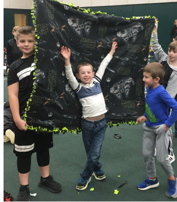
Fifth graders enjoyed working with Primary School students on the Quilt Project for community members in need.